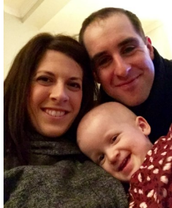
The Short Family of Deer Lake